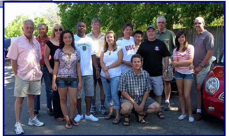
Fun and Friends at the Detail-Fest & Mirror Lake Drive