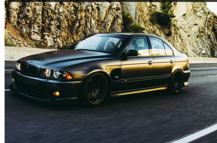
Utah Association of Euros - Facebook

www.facebook.com/groups/WasatchChapterBMWCCA/