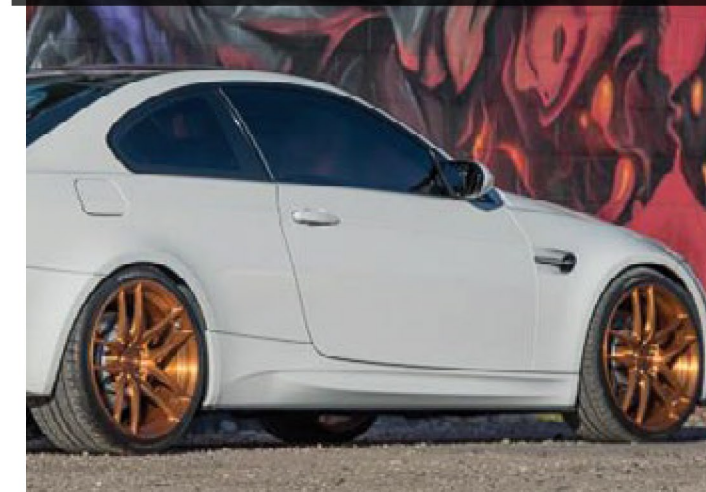
Utah BMW Enthusiasts