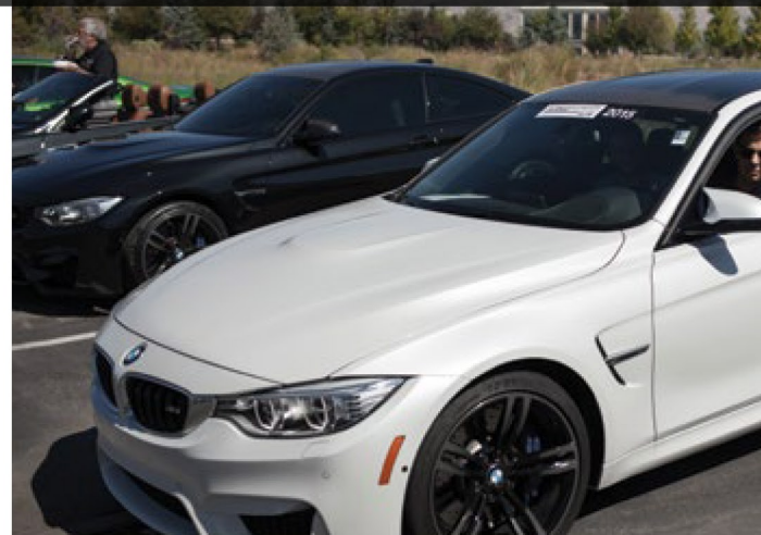
BMW CCA - Facebook

www.facebook.com/groups/WasatchChapterBMWCCA/