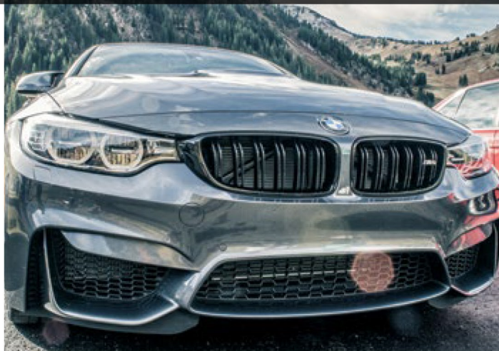
BMW CCA - Flickr

Be sure to check our social pages often for event and meet updates and pics, and make sure to check out UAE and UBE events on their social sites as well!